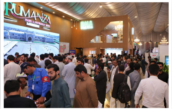
Closing Ceremony 31th March, 2022 at Marriott Hotel, Islamabad