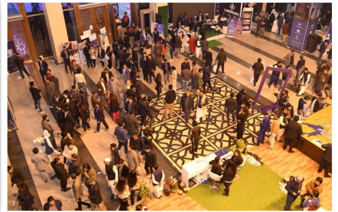
Closing Ceremony , Chief Guest President of Pakistan Dr. Arif Alvi 30th Nov, 2021, Sheesh Mahal Hall, Islamabad Serena Hotel