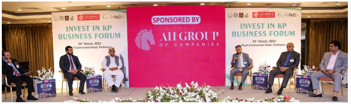
Invest In KP Conference 24th March, 2022 Pearl Continental Hotel, Peshawar