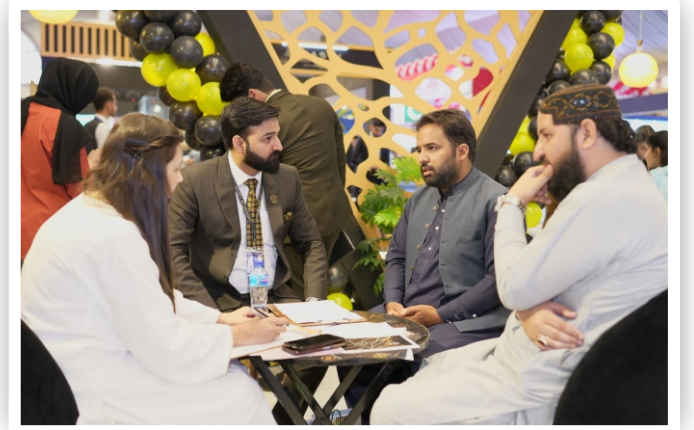
Closing Ceremony 23rd February, 2023 at Islamabad Serena Hotel