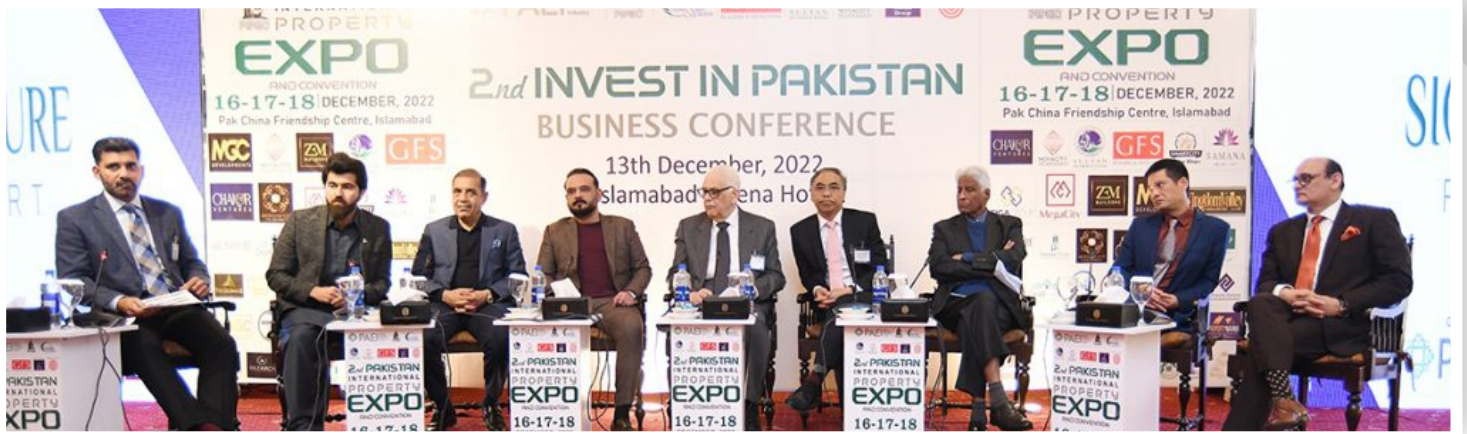
2nd Invest In Pakistan Conference 13th December, 2022 Shamadan Hall, Islamabad Serena Hotel