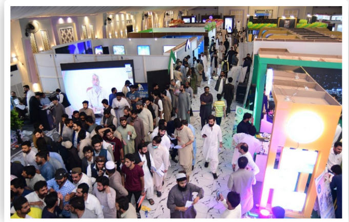
Closing Ceremony 2nd June, 2022 at Shamadan Hall, Islamabad Serena Hotel