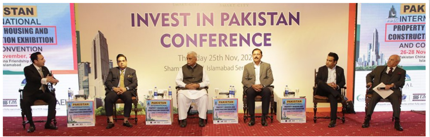
Invest In Pakistan Conference 25th November, 2021 Shamadan Hall, Islamabad Serena Hotel