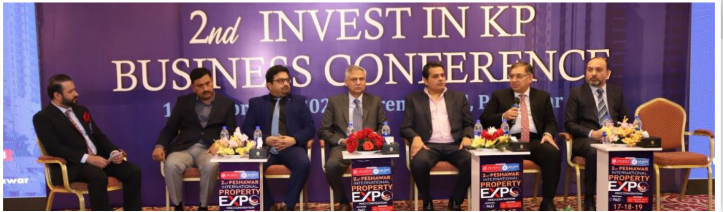
2nd Invest In KP Conference 16th February, 2022 Serena Hotel, Peshawar

Marbella Cave Marquee, Warsak Road, Peshawar