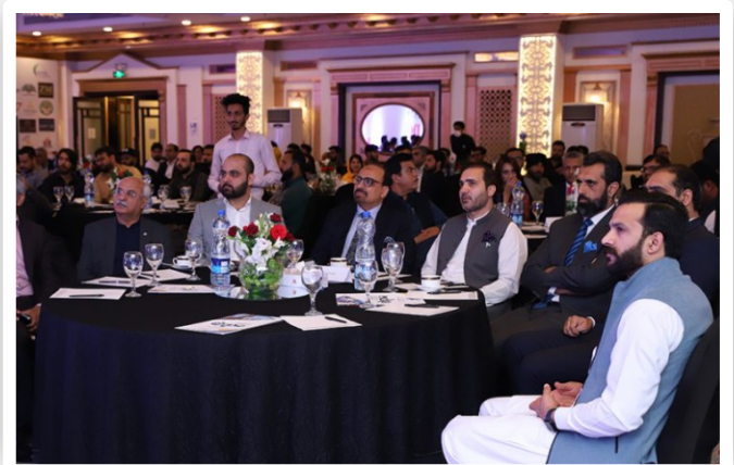
Deputy Chairman, Senate of Pakistan Mirza Muhammad Afridi graced the occasion of Chief Guest